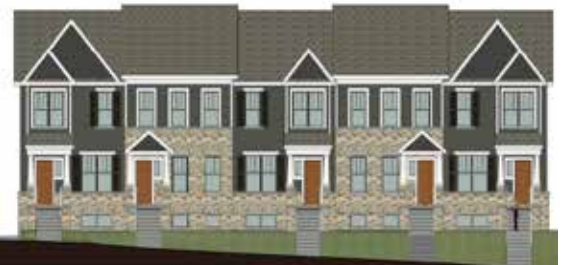
Rendering of new townhomes