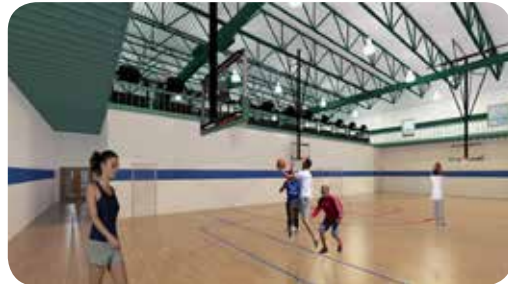
Rendering of view from East court, enclosed group fitness space, expanded fitness

Once completed, work will begin on the fitness area expansion, which will be located on two levels on the westernmost court in the gymnasium. On the main level there will be three dedicated group fitness rooms, with additional fitness space inside of the track area on the second floor.