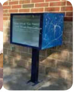
The Hope Box

The project could not have been completed without the students and mentors who volunteered their time. Also, a big thank you to Menards for donating the supplies!