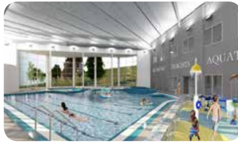
Rendering of new pool

We are happy to announce THE HEIGHTS Community Center and Memorial Library are about to embark upon some much needed repairs and renovations starting in 2019. In the spring, a new pool will begin construction, with some exciting new features including: four lap lanes with a deep end of 9 feet; an enlarged hot tub; a larger 3.5 feet deep body of water for programming and play; a spray ground for the little ones; and an upgraded steam room, sauna, and locker rooms. This phase is estimated at a six month completion, re-opening in the Fall 2019.