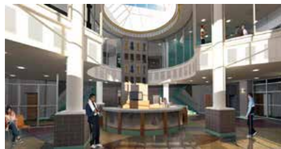
Rendering of enclosed balconies

More photos and a schedule can be found in the Winter PARC brochure or at www.myheights.info .