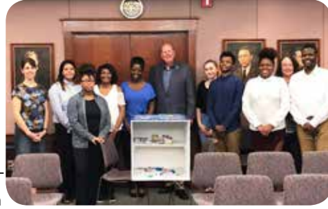
2017-18 Youth Council

Last year the Richmond Heights Youth Council participated in a community service project where they constructed a "Hope Box" (pictured below). It is a container to hold non-perishable food items and hygiene products with the saying "Take what you need, Give what you can" posted on the front. Located outside THE HEIGHTS Community Center, the Hope Box was created by the students to be a helpful resource to those in need.