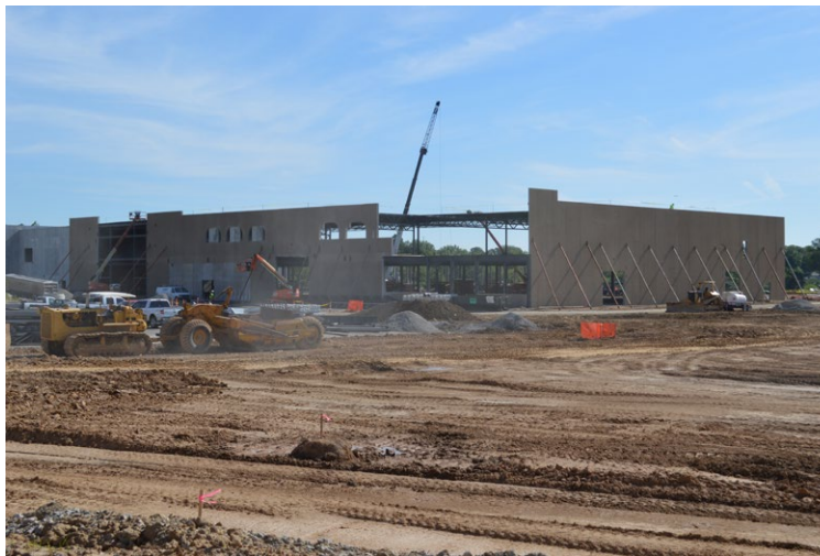
Construction crews build the Menards home improvement store at the southeast corner of Hanley Road and Elinor.

awarding the construction contract for the public works building to Raineri Construction.