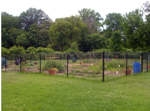
The Maplewood and Richmond Heights Community Garden.

Got a green thumb and in need of a space to use it?