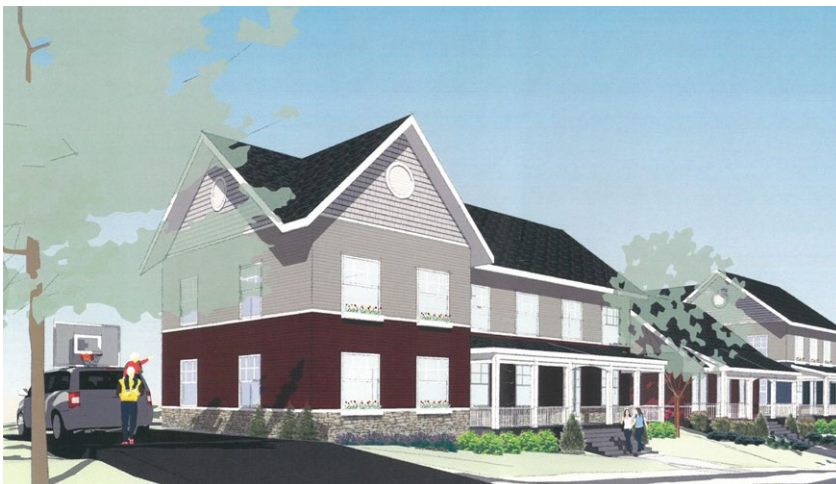
A rendering of the Boys Hope Girls Hope youth residences that will be built at 8031 Elinor Ave., just north of Menards.

Plans are moving forward for the Boys Hope Girls Hope project, which will be built at 8031 Elinor Ave., just north of the Menards development.